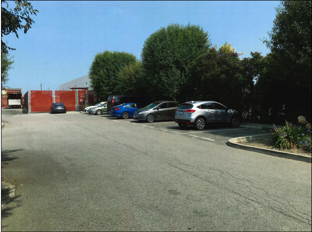
FIGURE 7 View of Driveway and Parking Lot off Riverside Drive (Image date: August 16, 2021)