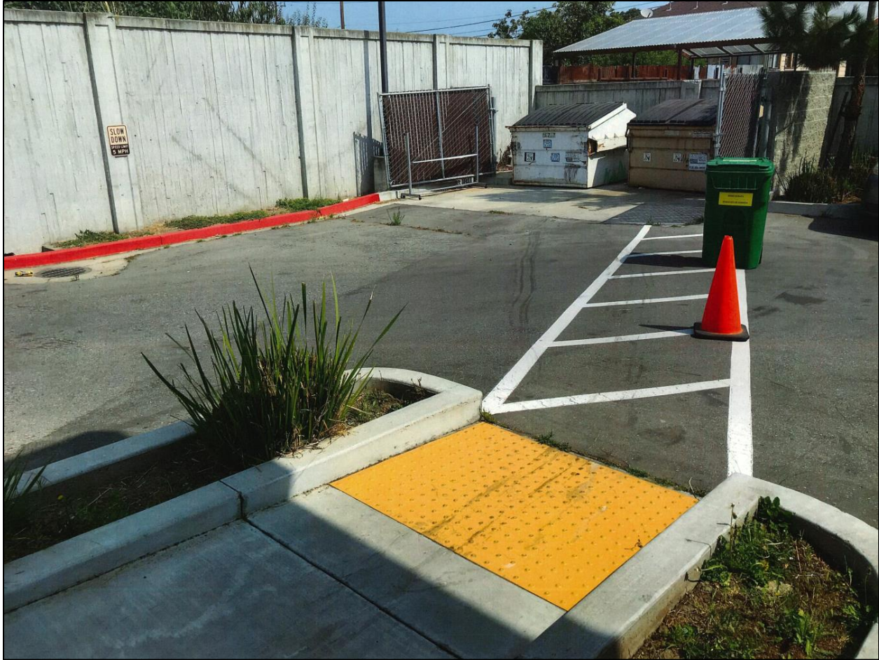
FIGURE 5 View of Trash Enclosure (Image date: August 16, 2021)