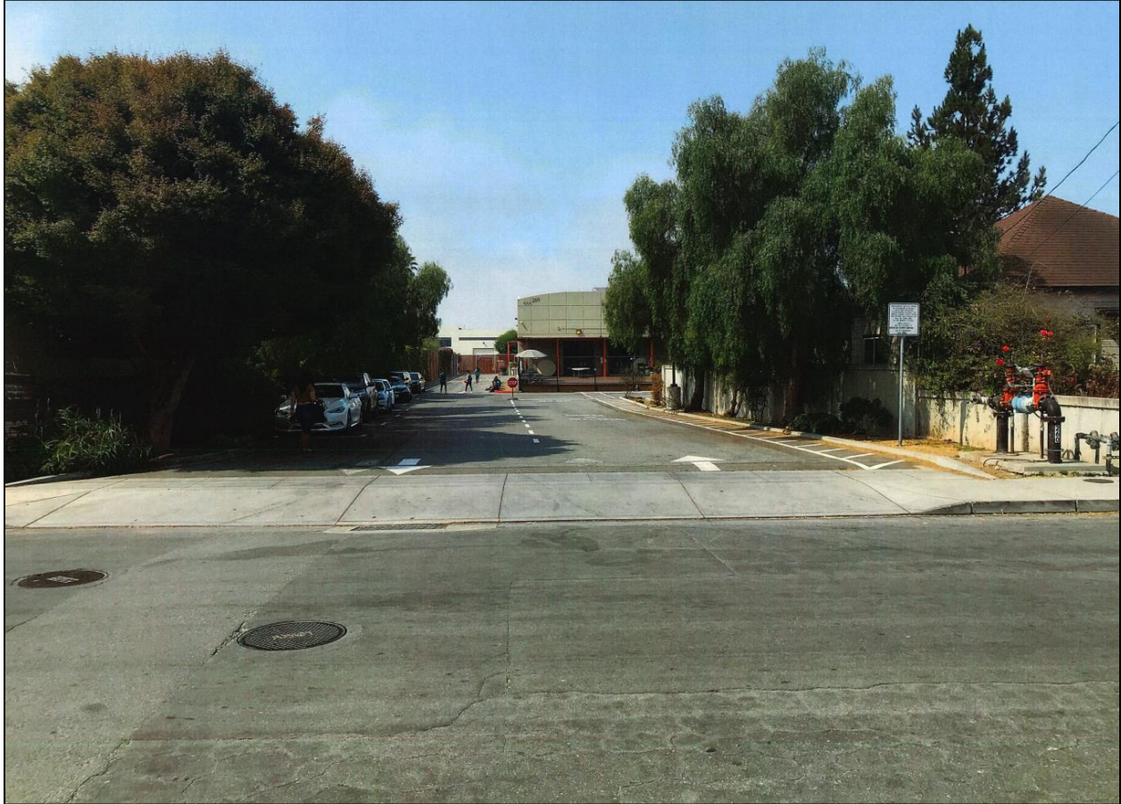
FIGURE 1 View of Main Driveway Approach off Locus Street (Image date: August 16, 2021)

The following photographs show existing vehicle driveways, pedestrian walkways, parking, drainage/stormwater features, landscaped areas, trash enclosure, and fencing.