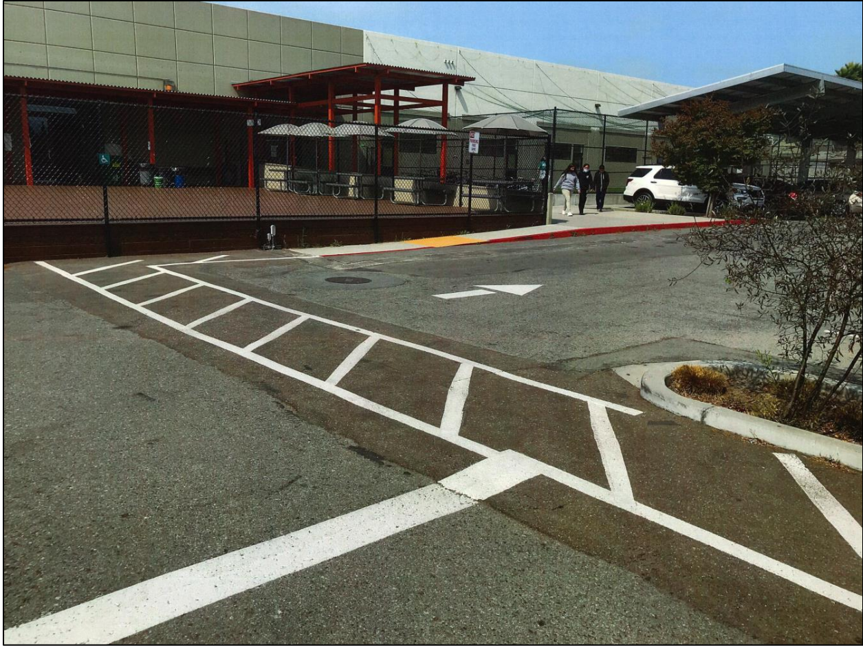
FIGURE 2 View of School's Front Entry from Main Driveway (Image date: August 16, 2021)