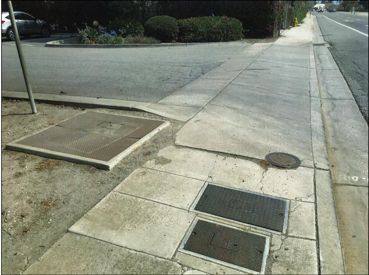
FIGURE 6 View of Driveway Approach off West Riverside Drive (Image date: August 16, 2021)