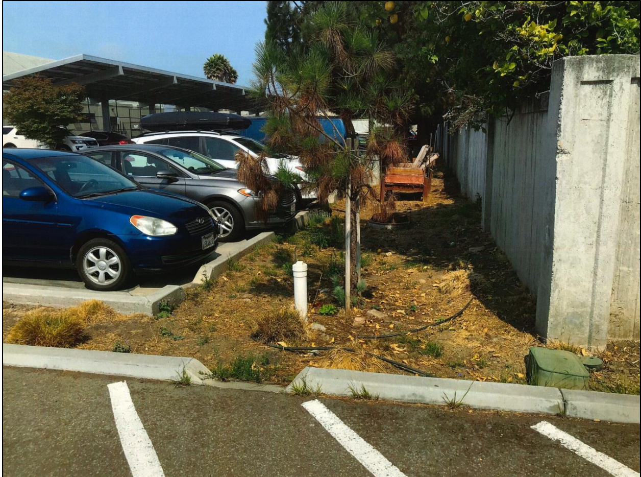
FIGURE 3 View of Bio-retention Swale from Main Driveway (Image date: August 16, 2021)