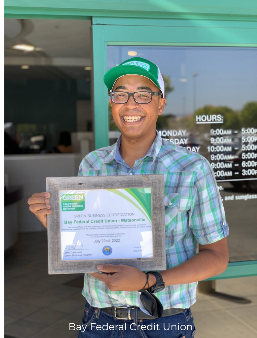
Bay Federal Credit Union