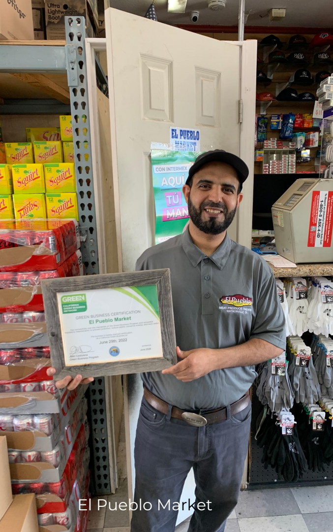
El Pueblo Market