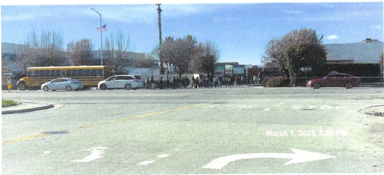
Ceiba students disembark from the two buses and enter the Ceiba campus on Highway 129 driveway access.