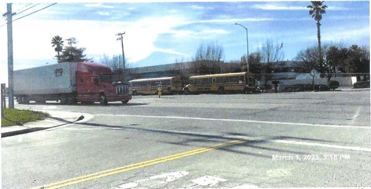
Two Monterey County Office of Education School buses dropping off students along the shoulder of Highway 129.