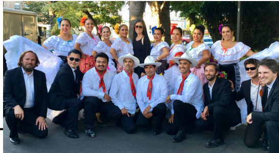
EDV with SC Symphony, Fall 2019 @ Watsonville Plaza