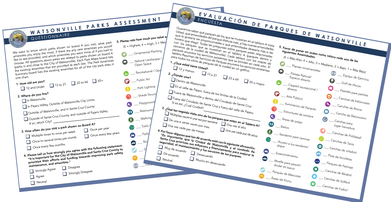
FIGURE 7. SURVEYS GIVEN TO COMMUNITY MEMBERS DURING OUTREACH PHASE

The process of gathering data for each of these categories in order to develop an equity score for each park is further explored in the next chapter.