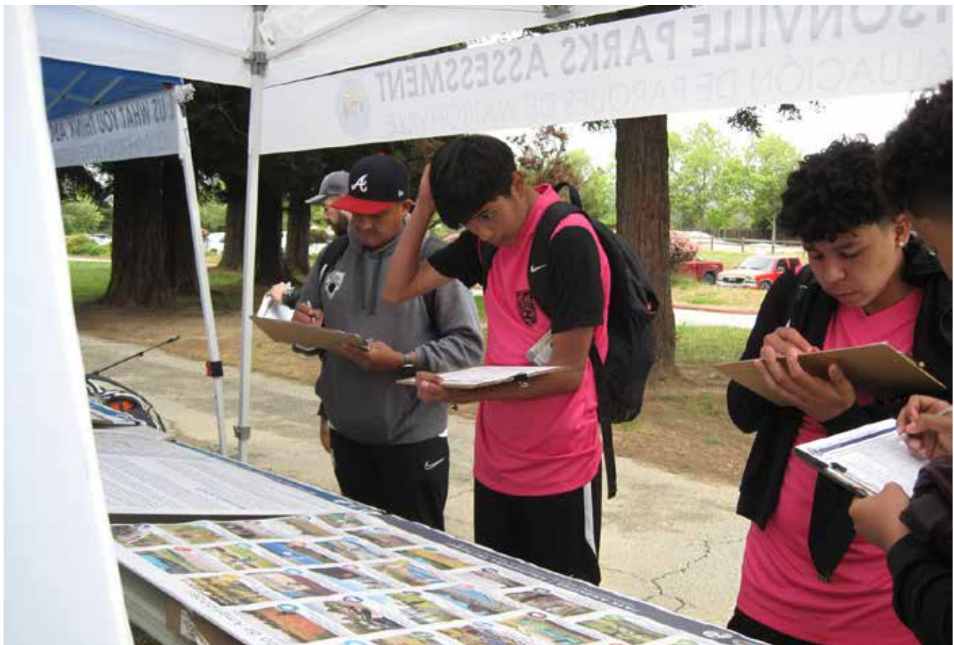
FIGURE 5. COMMUNITY MEMBERS FILLING OUT QUESTIONNAIRES AT WORKSHOP #1

The GIS database can be updated by park staff in the future to help the City maintain an accurate overview of park infrastructure across the park system. The City plans on integrating the GIS data gathered during this assessment into Cityworks (the City’s public asset management software) to further develop the City’s management of park infrastructure.