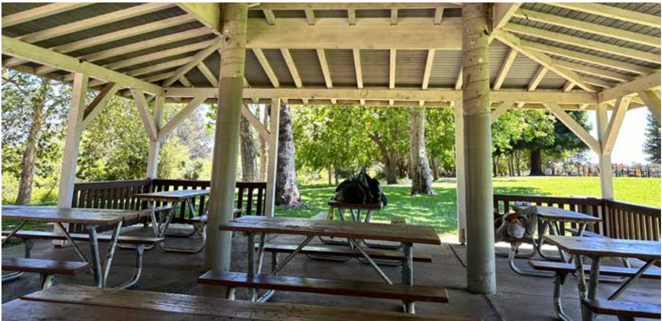
FIGURE 2. PICNIC AREA AT PINTO LAKE COUNTY PARK

The assessment will be utilized by both City and County staff to help make informed decisions on future capital improvement projects, and by Parks Maintenance Staff to identify and keep a record of park infrastructure that are most in need of attention. The assessment is also a resource for City Council and the County Board of Supervisors to stay informed about the current