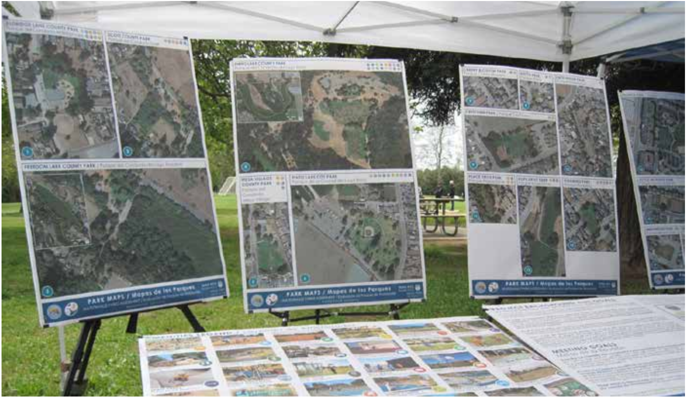
FIGURE 6. INFORMATIONAL MAPS AT WORKSHOP