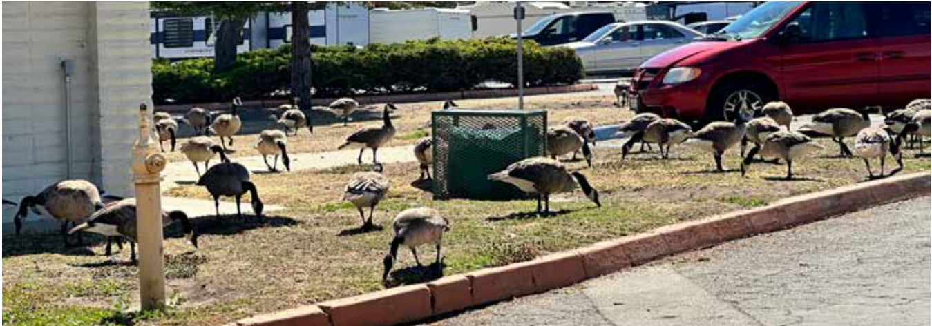
FIGURE 3. GEESE AT PINTO LAKE CITY PARK

and future needs of the park system, and for the community to understand the data behind the decisions made about funding park projects. Application of this assessment will help the City and County move towards an improved park system that provides enjoyment and added value to the community.