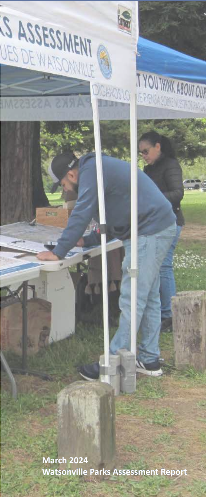
March 2024 Watsonville Parks Assessment Report