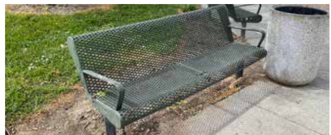
FIGURE 4. BENCH AT RIVER PARK

From a basic bench where seniors rest, to playground structures for children, and sports fields used to host programmed events, parks are composed of a wide range of infrastructure. To simplify and organize into categories all of the unique types of park infrastructure, a Parks Infrastructure List was created (see figure 8).