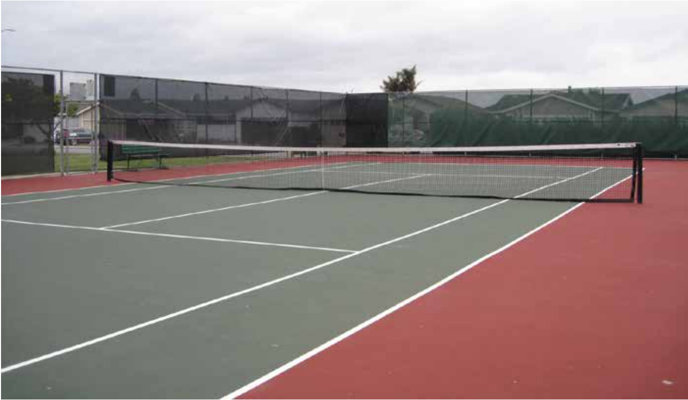
FIGURE 1. TENNIS COURT AT JOYCE-MCKENZIE PARK