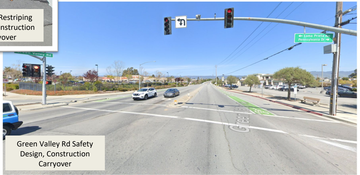
Green Valley Rd Safety Design, Construction Carryover