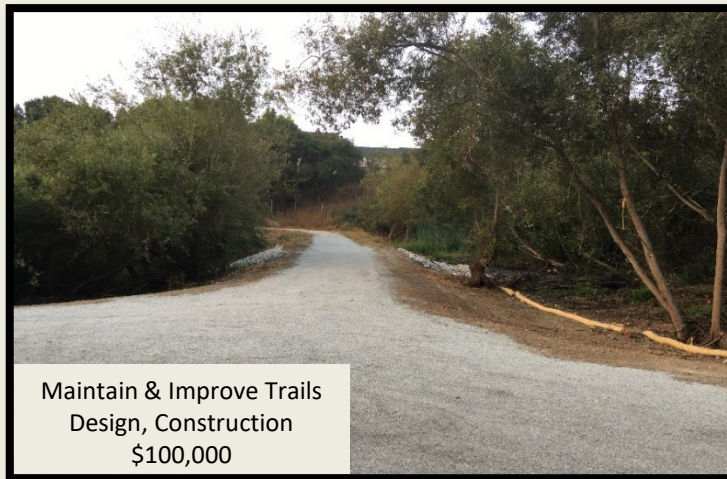
Maintain & Improve Trails Design, Construction $100,000