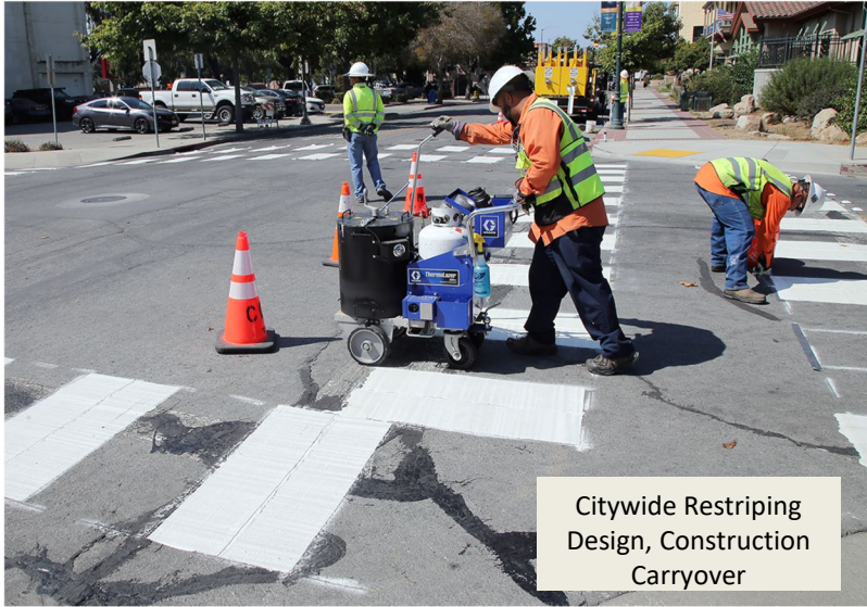
Citywide Restriping Design, Construction Carryover