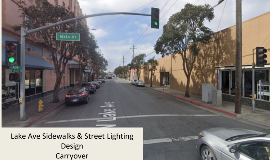
Lake Ave Sidewalks & Street Lighting Design Carryover