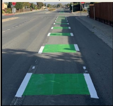
Citywide Bicycle Facilities Programs, Design, Construction $100,000