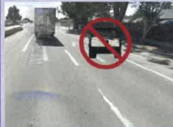
Riverside Dr (HWY 129)