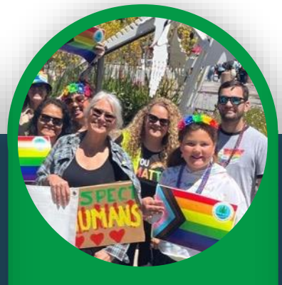
Santa Cruz County Behavioral Health