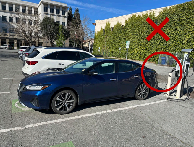
At City Hall (250 Main)