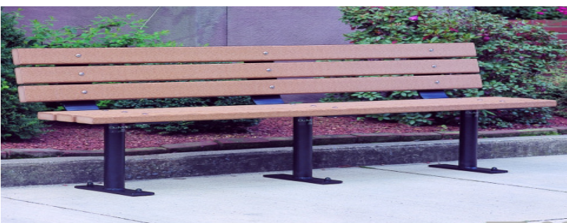
Recycled Plastic Benches w/ Backs