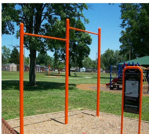
Community Garden & Par Course