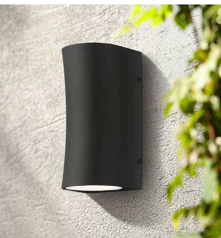
Exterior Wall Sconces