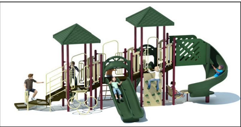
Children's Playground equipment