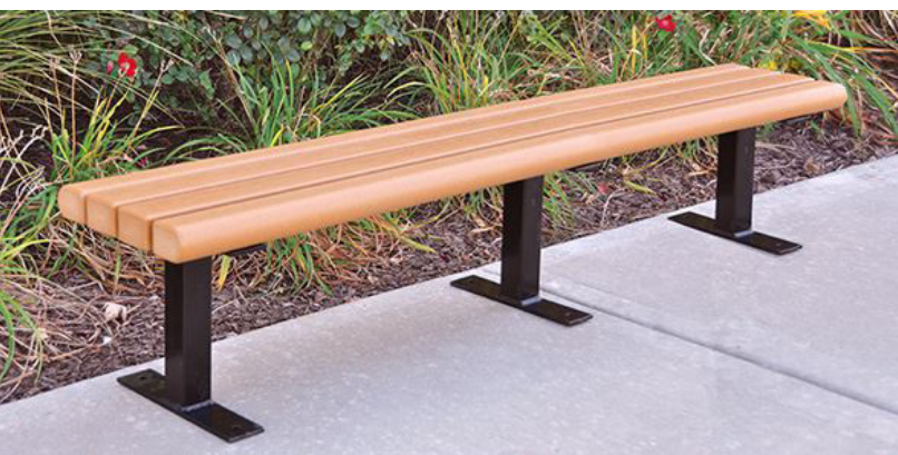
Recycled Plastic Benches