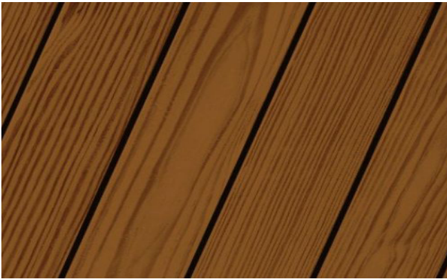
Wood Stain #1