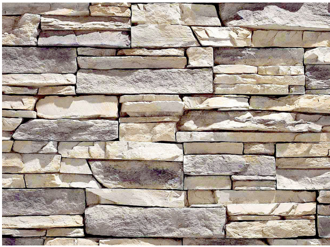
Stone Wainscotting #1