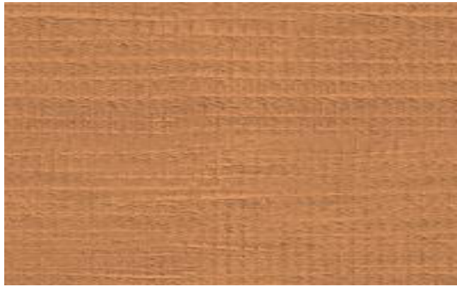
Wood Stain #2