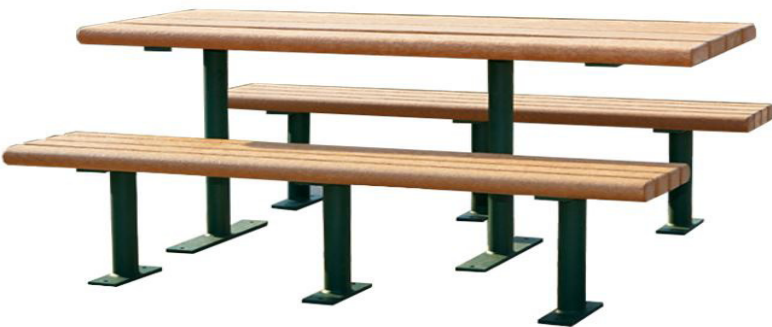
Picnic Tables & Benches