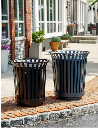
Trash Receptacles & Walkway Light Bollards