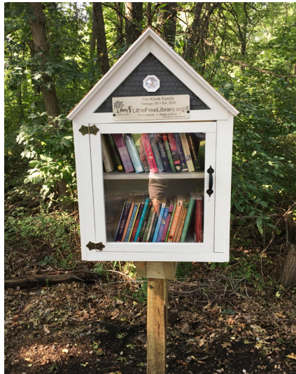
Community BBQ & Book Library