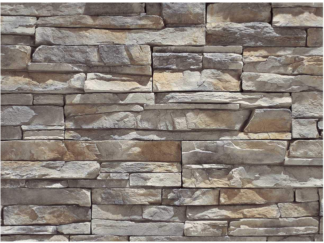
Stone Wainscotting #2