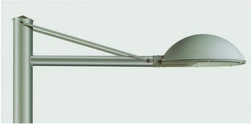
Street Light Standards