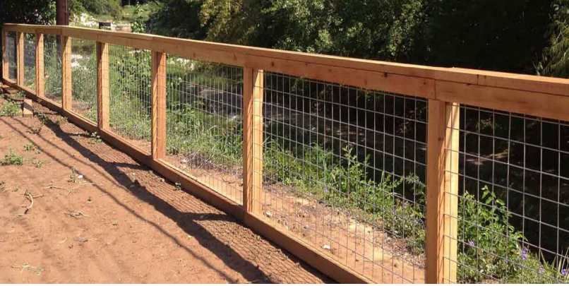
Post & Wire Perimeter Fencing