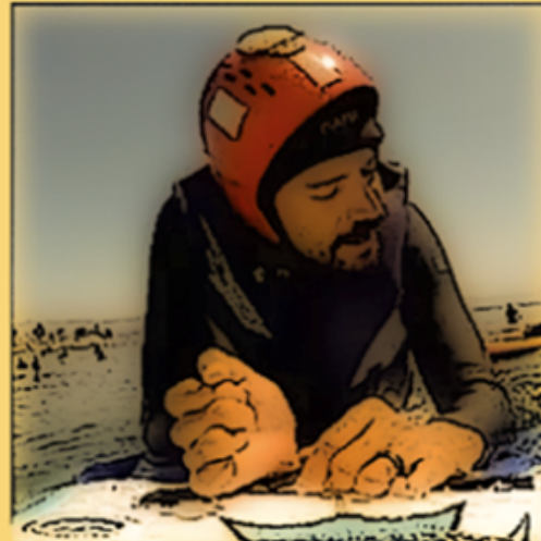
CLAUDIO MORALES - Adaptive Surfing League World Champion, 2020