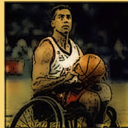
TROOPER JOHNSON - US Paralympic Basketball Team 1992, 1996, 2000, 2004