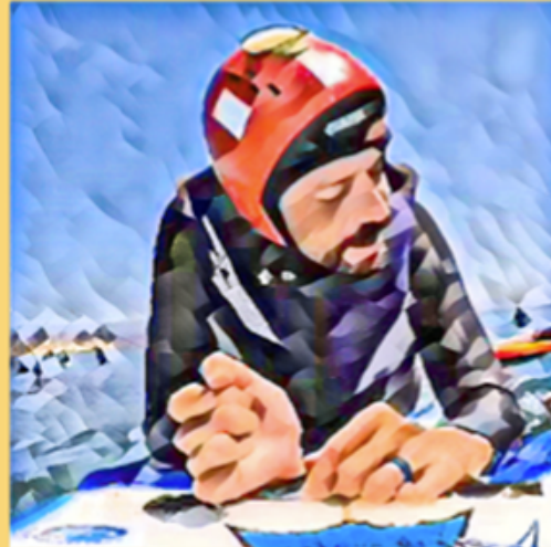
CLAUDIO MORALES - ADAPTIVE SURFING LEAGUE WORLD CHAMPION, 2020