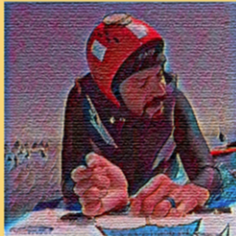
CLAUDIO MORALES - ADAPTIVE SURFING LEAGUE WORLD CHAMPION, 2020