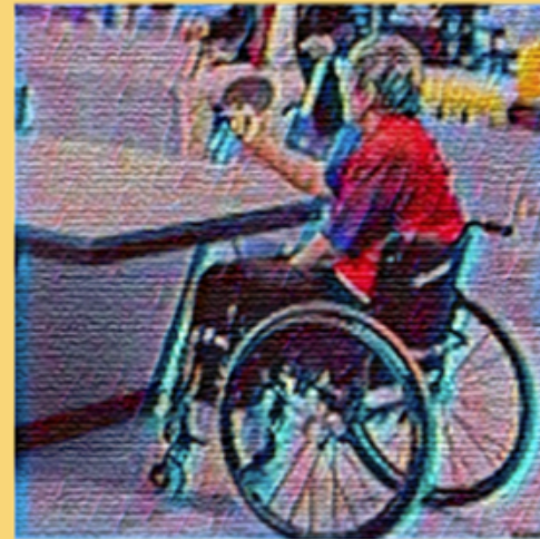
SEBASTIAN DEFRADESCA - US PARALYMPICS TEAM, TABLE TENNIS, 1988, 1992, 1996, 2000