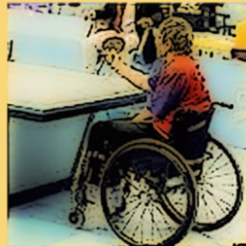
SEBASTIAN DEFRANCESCA - US Paralympics Team Table Tennis, 1988, 1992, 1996, 2000