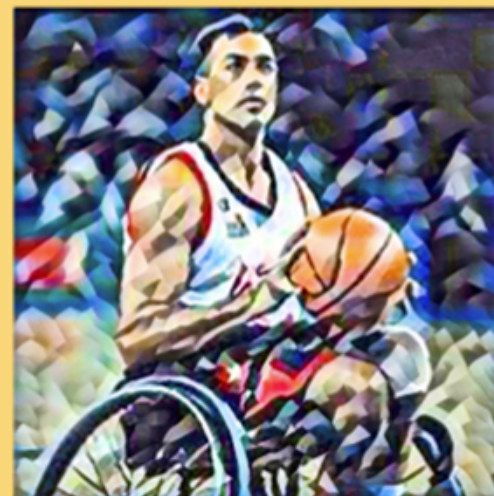
TROOPER JOHNSON - US PARALYMPIC BASKETBALL TEAM, 1992, 1996, 2000, 2004