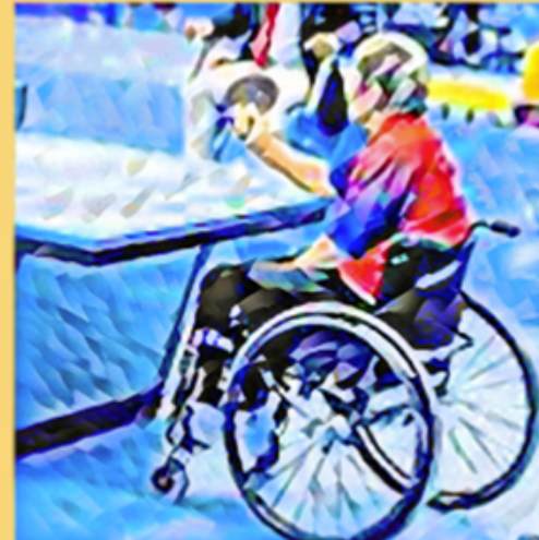
SEBASTIAN DEFRANCESCA - US PARALYMPICS TEAM TABLE TENNIS 1988, 1992, 1996, 2000