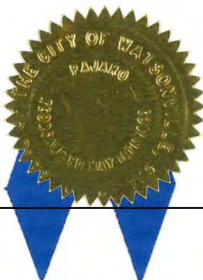
Jimmy Dutra, Mayor

IN WITNESS WHEREOF, I have hereunto set my hand and caused the Seal of the City of Watsonville to be affixed this 11 th day of November, Two thousand and twenty one.